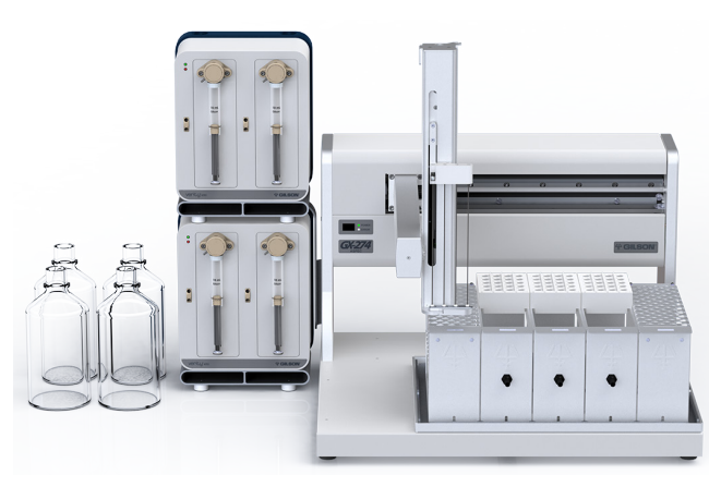
Figure 1 Gilson GX-274 ASPEC® system

Equine drug testing laboratories face the challenge of rapidly and accurately detecting drugs and other foreign substances that are prohibited in horse racing. 1 Automation with the Gilson GX-274 ASPEC® system provides a reproducible,