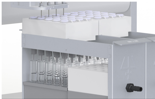
Figure 2 The system is equipped with four probes, permitting four samples to be processed simultaneously with automated solid phase extraction.